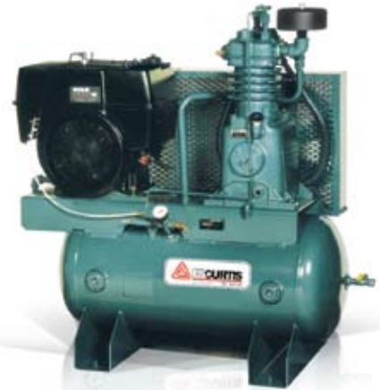
CVG-969TEG-K 13HP tank mounted gas Kohler engine