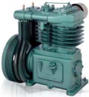
C-98 basic pump