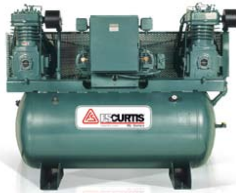
CVD-9711B 10HP duplex tank mounted electric