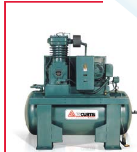
CV-9814B 25HP simplex tank mounted electric

Since 1854, CURTIS Air Compressors has empowered generations with the air power needed to turn visions into reality. Today, FSCURTIS continues the legacy with the ML Series – cast iron, pressure lubricated, low RPM compressors that feature stainless steel valve assemblies, heavy cast iron connecting rods, oversized tapered main roller bearings, and a heavy duty ductile iron crankshaft.