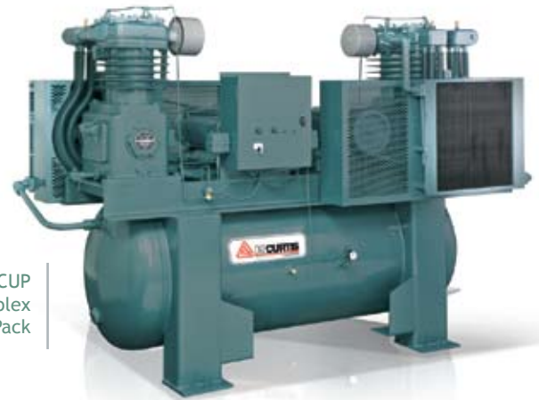
CVD9815CUP Duplex UltraPack