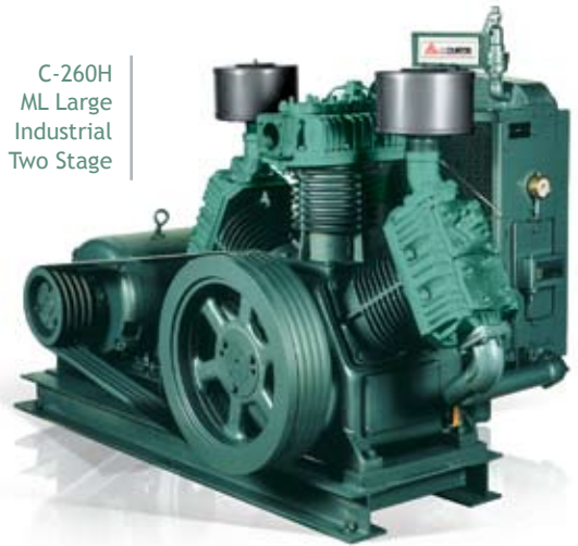
C-260H ML Large Industrial Two Stage