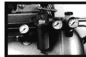
Illustration of PRV station rigidly mounted for easy accessibility.